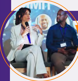
Member/Peer Panel - Do You Accept This Rose? Getting Providers, Staff & Leadership to Engage

Get an update on what's happening with state and federal healthcare legislation, and learn how you can play a role in supporting positive decisions with your legislators.