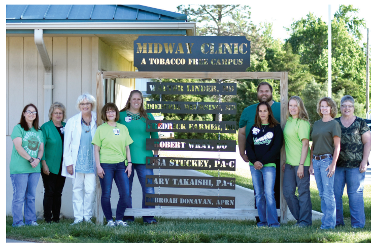
Midway Clinic staff members wore green to raise awareness of May being National Mental Health Awareness Month.

May also is mental health awareness month, so everyone wore green on Green Day. Although routinely allowed to wear jeans on Fridays, jeans may