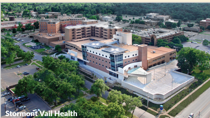
Stormont Vail Health

To identify community issues, Stormont Vail Health used heat maps, a flexible data visualization tool.